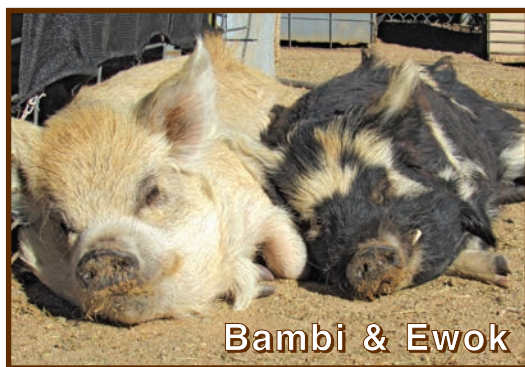
Bambi & Ewok

noticeable until he raises his head. We're unsure of Eleanor's exact breed, but she is a type of hog weighing about 600