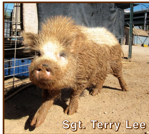
Sgt. Terry Lee

More wallows, more pools, more frequent filling and refilling...all that adds up to more staff time in the fields to do the watering. It also means more trips for the water truck drivers to bring water in to