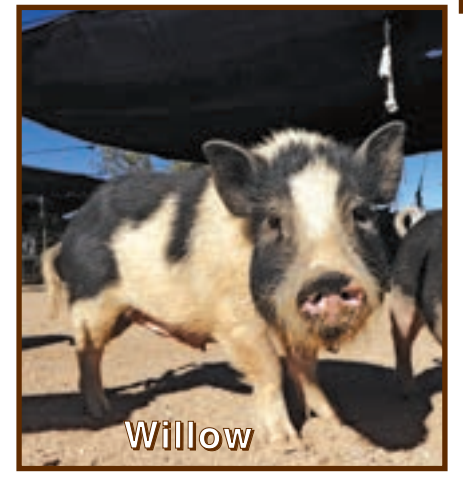
chance to gain some weight and let her body concentrate on growing to her full adult size which is reached by age 3. Luckily, Jessie and Leanne will never have to experience what their mom went through at such an early age.

gestation period is 3 months, 3 weeks and 3 days with an average litter size of 6-8 but as many as 15 is possible. Due to the short gestation time, a female can have 2 litters per year. If that continues uncontrolled, the toll on her body is immense particularly when breeding begins as early as 4 months of age. Having been spayed, now Willow has the