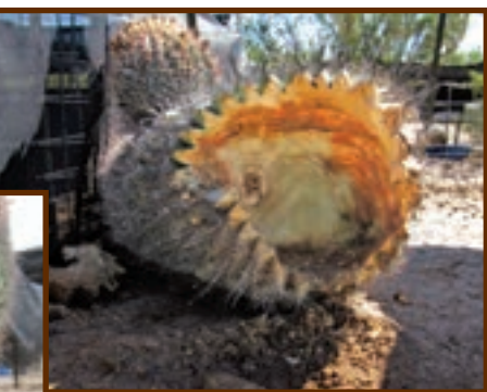
"jump" on whatever gets close. They are very painful and difficult to remove. A pig full of cholla "balls" is a nightmare!

Oddly, another of the cholla varieties common to this area are enjoyed in different ways by the