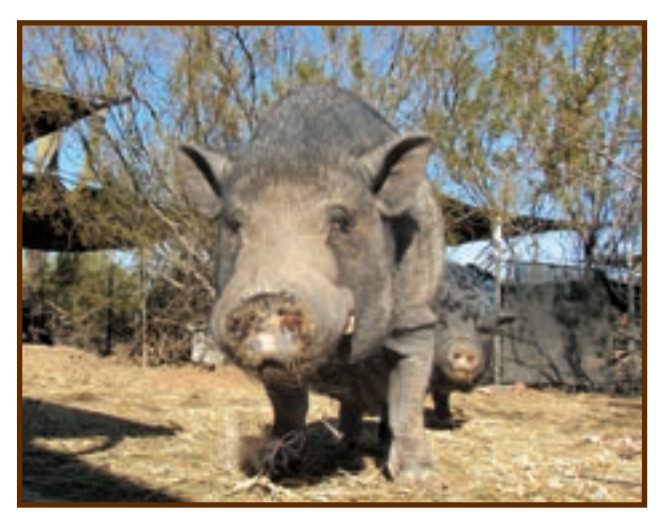
Elvis has been with us for 12 years and is one of our oldest residents at age 19. Olive, an 11-year-old who has lived here for 8.5 years, photobombed Elvis while he was giving his best "bedroom eyes".

*Better for the environment and less expense for the sanctuary! Let's "Go Green!"