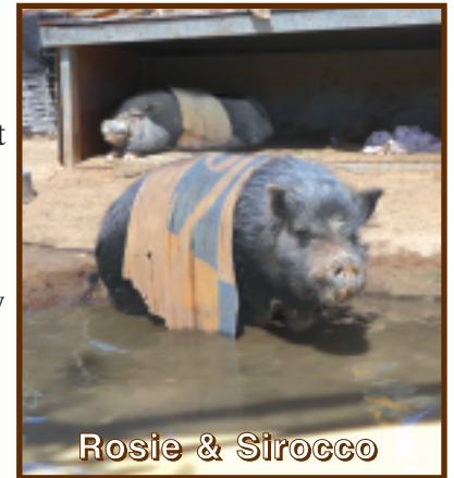
Rosie & Sirocco

Igloo coolers with ice water are placed in those areas. We will dip a lightweight towel in the water then drape it over a pig's shoulders to help lower their body temperature. Those are refreshed frequently throughout the day