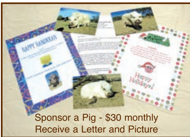
Sponsor a Pig - $30 monthly Receive a Letter and Picture