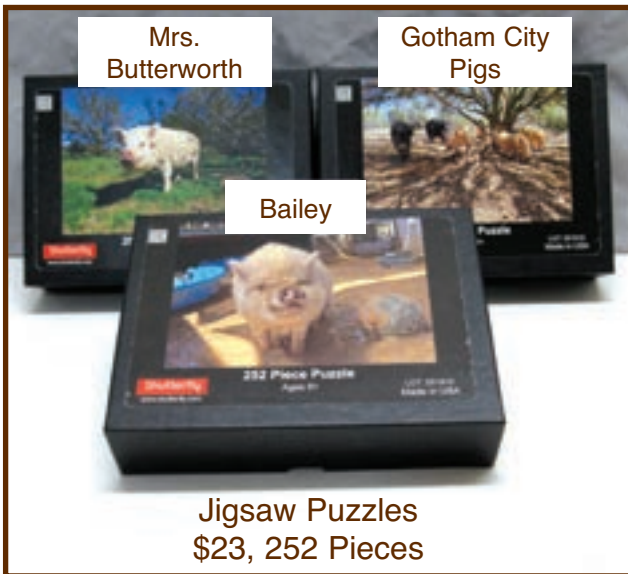
Jigsaw Puzzles $23, 252 Pieces