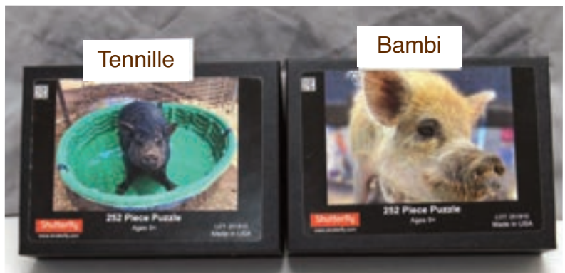
Jigsaw Puzzles $23, 252 Pieces