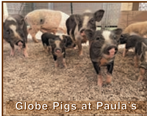
Globe Pigs at Paula's

Once we're certain of placement for each pig involved, we start organizing transport, confirming safe vehicles are being used, ensuring proper size kennels are available, coordinating schedules and setting up transport dates to get pigs loaded and safely moved over various distances, sometimes hours from where they currently reside.