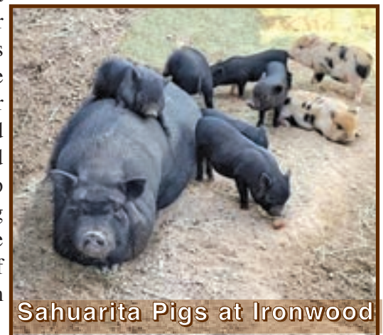
Sahuarita Pigs at Ironwood