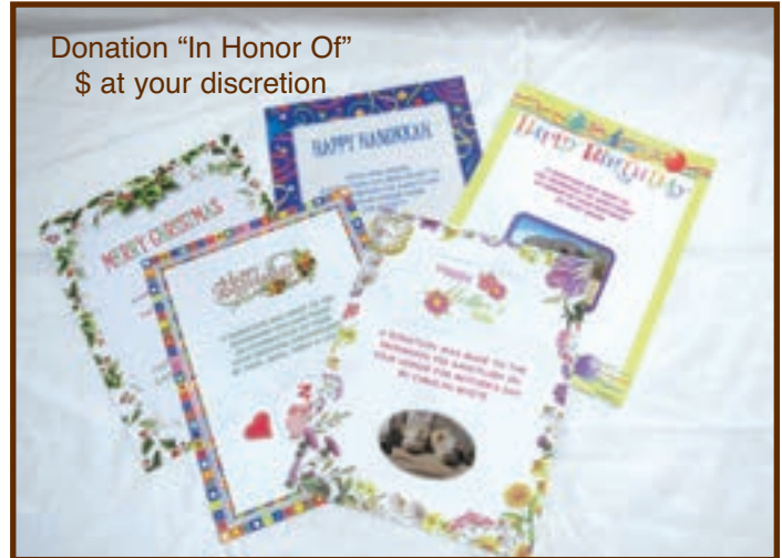
Donation "In Honor Of" $ at your discretion