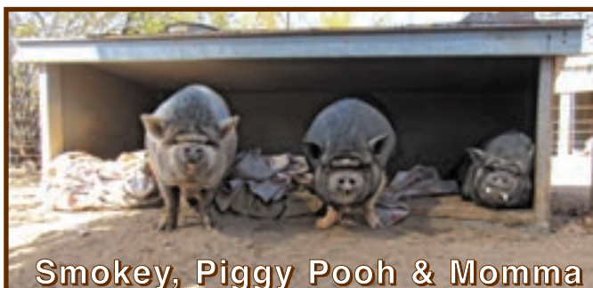
Smokey, Piggy Pooh & Momma

We have kept Piggy Pooh, Momma and Smokey together. After trying them in one of the mid-size fields, we moved them to a smaller area in order to keep the family together because Momma is quite lame. Piggy Pooh, as you can see from her picture, is the young lady with an attitude in this group, but she is learning to get along with the others in the small herd where she now lives. They have all lost a lot of weight and are enjoying life better now that they can move around more easily.