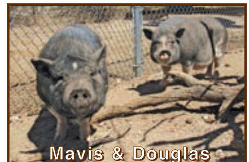
Mavis & Douglas

Mavis and Douglas were of course spayed and neutered. Later they were released with several others to the large Northwest Field. Mavis caused a lot of commotion with her newfound "friends" for a time, but she has settled in now. Douglas was rather timid around all the new competition, so he now eats in a feeding pen to ensure he gets his fair share. They can most often be seen together in their shelter when day is done.