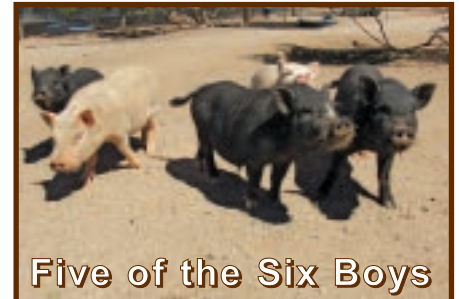
Five of the Six Boys

being bred and sold for meat. The first litter had been sold. There were four remaining from the second litter; Pedro, Miguel,