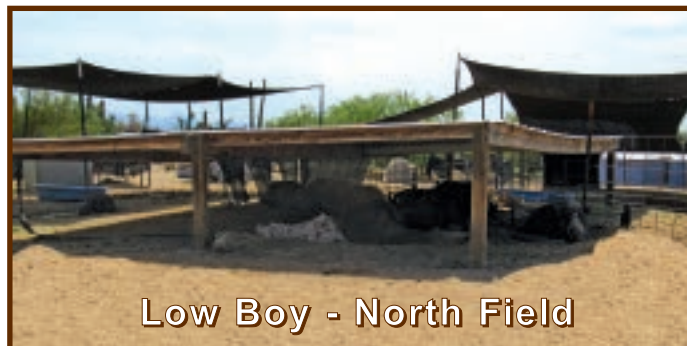
Low Boy - North Field

low boy will sometimes be filled with 20 or more pigs. Some of the low boys have shade cloth extensions built off the ends with pools and mud wallows underneath. Reuben will often get up, go take a dip in the pool then rejoin his buddies under the roofed portion. How convenient is that!