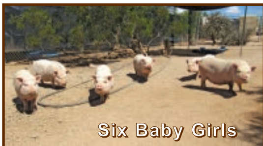
Six Baby Girls

I n my letter in the September newsletter I talked about the horrible crisis in pig breeding and overpopulation. This continues to be a huge issue. I mentioned we were going to start to spend more of our resources on reaching out to help those in need with out of control breeding situations. To that end we have made some progress. Some of the people in the situations I mentioned did reach out to us for help and were willing to cooperate with us in order to help them. I want to give you an update on the lives we have touched and how we are helping. In some cases the pigs are being returned to their homes after they have been spayed and neutered and in some cases we have taken the pigs here at Ironwood. One family in Tempe was spiraling out of control. We brought their 4 males here to neuter then lulated the remaining adult females that we thought were pregnant. Once the boys were ready to return home we took them back then picked up the six young females pictured here. What cute little chunky girls they