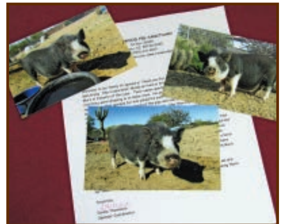
Sponsor a Pig