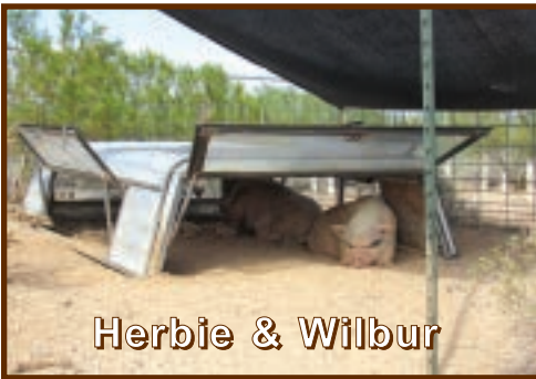
Herbie & Wilbur

staked their claim on the camper shell in the back of the Far East