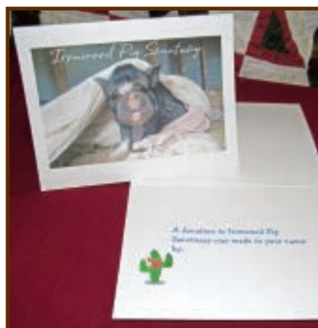
In Honor Of or Memory Of