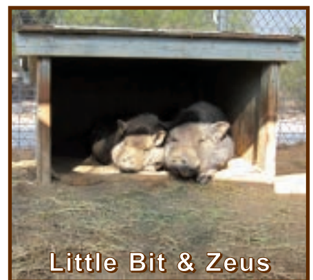
Little Bit & Zeus