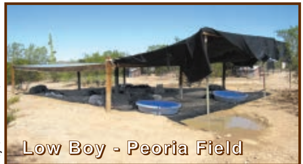
Low Boy - Peoria Field

Some of the larger fields have what we call a "low boy" shelter. These are flat roofed, open-sided shelters set low to the ground. In the summer the sides are either open or have shade cloth to block the sun. For the winter months we hang carpets on all four sides to enclose the shelter creating a warm cozy place to fill with blankets and/or bedding hay. The low boys are popular with large groups of friends. In the Peoria Field, the