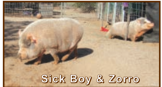
Sick Boy & Zorro

Pictured here are the faces of those we have spayed and neutered and whose lives we have changed forever. They are happy and healthy. You can see from the survival rate that most do not make it in life. There are very few